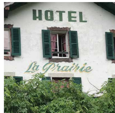
Conception : Cybergraph Chamonix