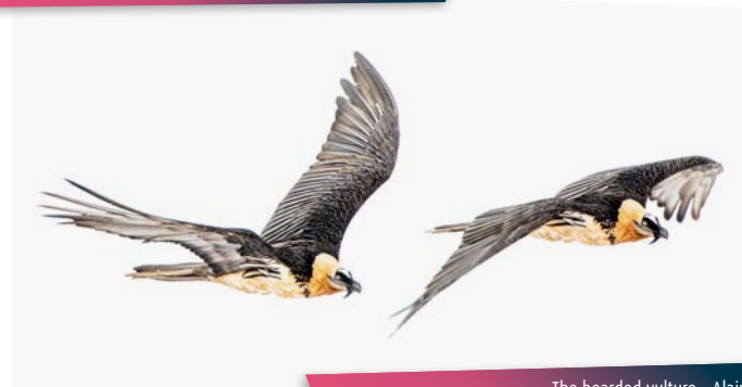
The bearded vulture - Alain

And if you have the privilege of being led by a mountain guide, don't miss your chance to fully take in the magic of the place: head over to the "moon hole", a remarkable rocky arch, to admire the view of the Râteau d'Aussois.