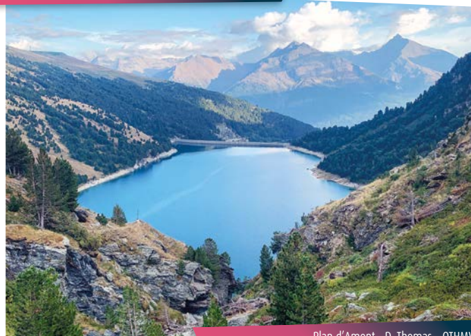
Plan d'Amont - D. Thomas - OTHMV

At La Fournache refuge, take a rest as you imagine all those seasoned mountaineers heading towards Pointe de Labby or Dent Parraché, majestically rising up above you to a height of over 3,500 metres above sea level.