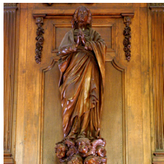
The Assumption of the Virgin

Go along the structure and turn on the left under the covered passage. Go down to the Casino 6 . Enjoy the flowered city park Joannès Moulard . At the bottom of the parc, reach the brick pavilion.