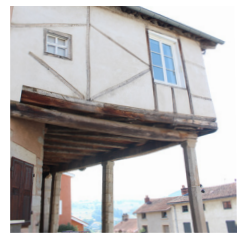
House with columns 15

On the place of the Roches, old market place, admire the house with columns 15 . Pass under this house. You can see, at the exit of the covered passage, an old watchtower from the sixteenth century (restored with the upper made in wood).