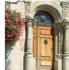
Devise door ②

Start point on the Devisse place, in front of the city hall which is from 1869 ①. On the other side of the place, on the way to go the church (on the left), admire the Devise door ②, from 1538. This name comes from the Mote and the Beam parable illustrated in latin.