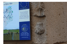
House St Jacques 12

The following house called «House St Jacques» 12 from the fifteenth century, it is now transformed into artists workshops. You can see, at the corner, at the ground floor, a sculpted scallop shell.