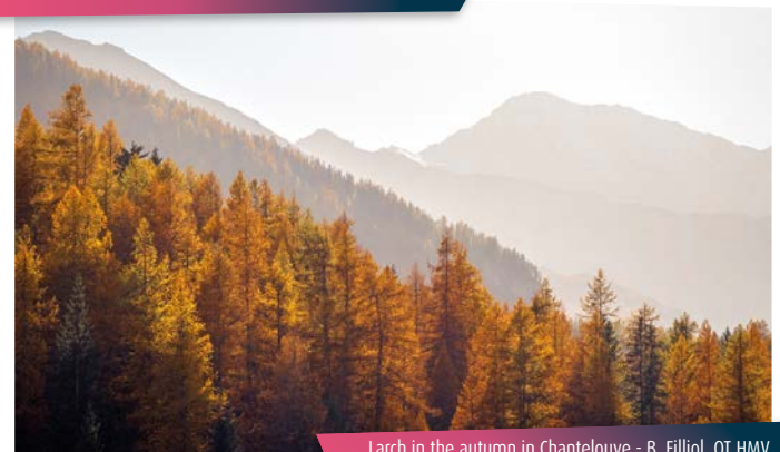
Larch in the autumn in Chantelouve

It might distract you from the stunning view of the opposite slope. The Vallonbrun are simply glorious.