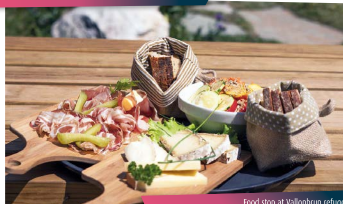
Food stop at Vallonbrun refuge

A few steps more and you can treat yourself to a delicious food stop at Vallonbrun refuge. Allow yourself to dream of a multi-day adventure. Maybe next time?