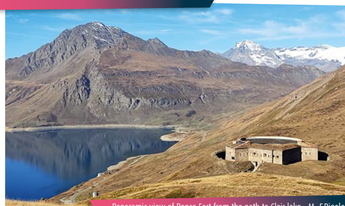
Panoramic view of Ronce Fort from the path to Clair lake - M.-F.Rigolet

As you turn back, towards the sun reflected on the distant waters of Mont Cenis lake, a burst of colours greets your enchanted eyes: alpine flowers that only grow at this altitude, such as violets, bluebell campanulas, and yellow trolles.