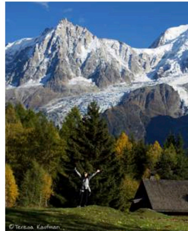
15 / PRESS FILE SUMMER 2020

Tel. Teresa - +33 6 08 95 89 42 - www.teresakaufman.com