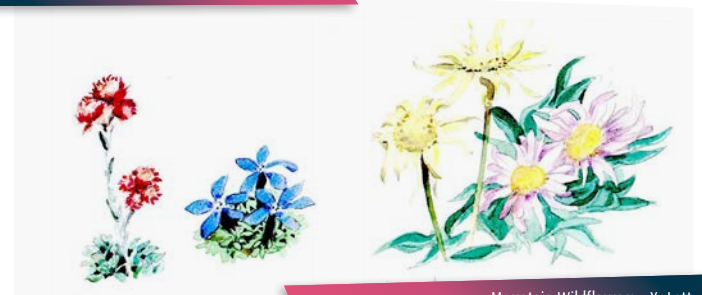
Mountain Wildflowers - X. Lett

Strike out at a leisurely pace, to the peaceful hum of foraging bees. All these pollen-filled pistils are miniature paradises for them. In June and July, an opulent feast of colours and sweet fragrances is laid out for you. Already, you can almost taste the mountain honey. Before going to sample it in the village, follow the many little signs laid out for you in summer.