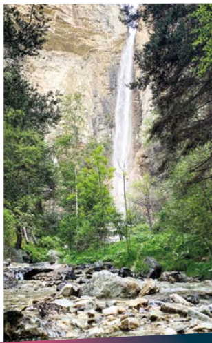
St-Benoit waterfall - B. Thomas, OT HMV