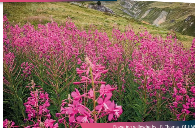
Flowering willowherbs