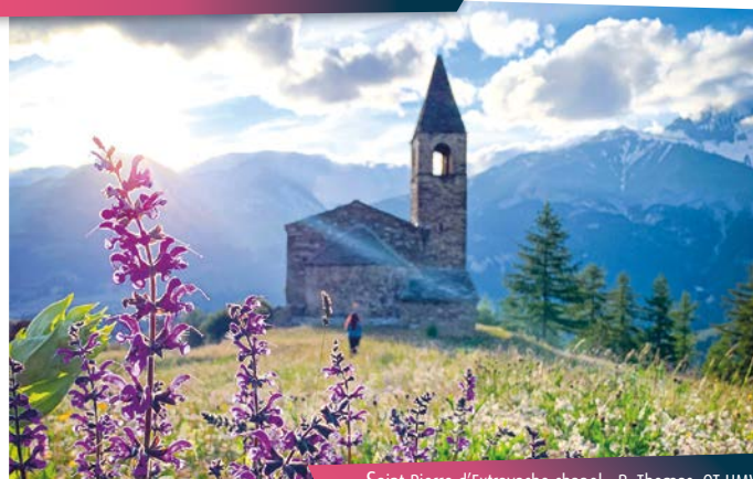
Saint-Pierre d'Extravache chapel

On the way back, don't miss the venerable Romanesque church of Saint-Pierre d'Extravache, whose origins date back to the 12 th century. Considered the first place of Christendom in the Savoie, it's well worth a visit!