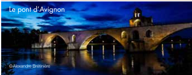
Le pont d'Avignon