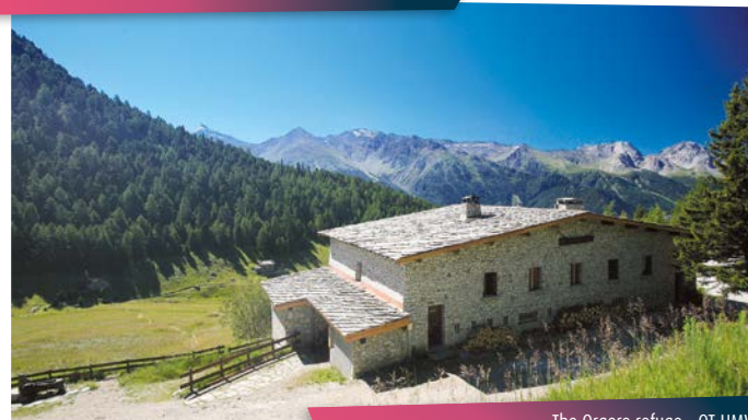
The Orgère refuge - OT HMV

When you return, walk through the alleys of Villarodin and Le Bourget to hunt out some heritage secrets.