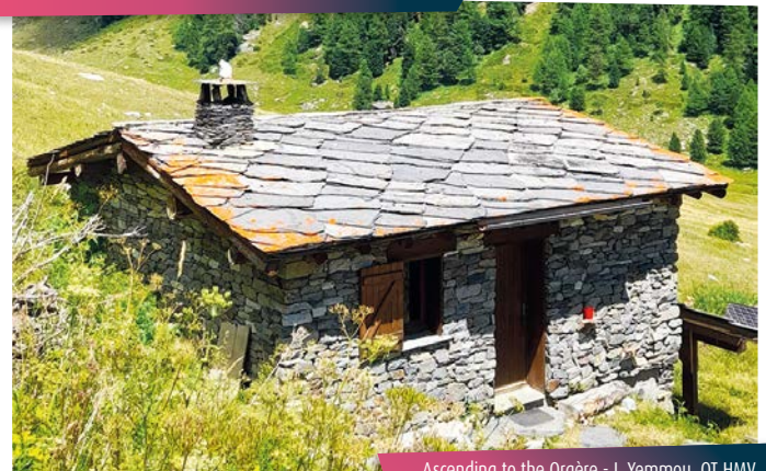
Ascending to the Orgère

This pleasant hike of one or two stages is the perfect getaway.