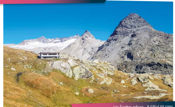
Les Évettes refuge

After a challenging hike that should not be underestimated, the glacial lake of Grand Méan awaits you with breathtaking views. Little icebergs in Haute Maurienne Vanoise? Simply fascinating!