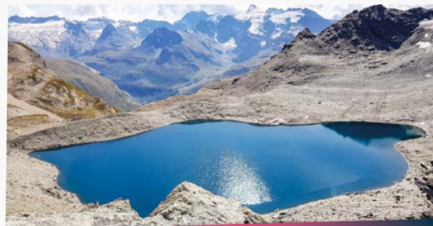
Les Fours lake

Ptarmigans are homochromatic. The magic of their plumage allows them to blend in with their surroundings. To achieve this camouflage, they molt three times a year, changing their attire in summer, autumn, and winter.