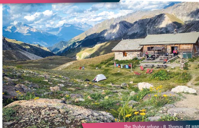
The Thabor refuge

Let's go! Just a bit further, and the Rond and Long lakes will reveal their glories step by step. Recognise the Three Kings behind you, standing proudly? Balthazar, Melchior and Gaspard are lords and masters of the place.