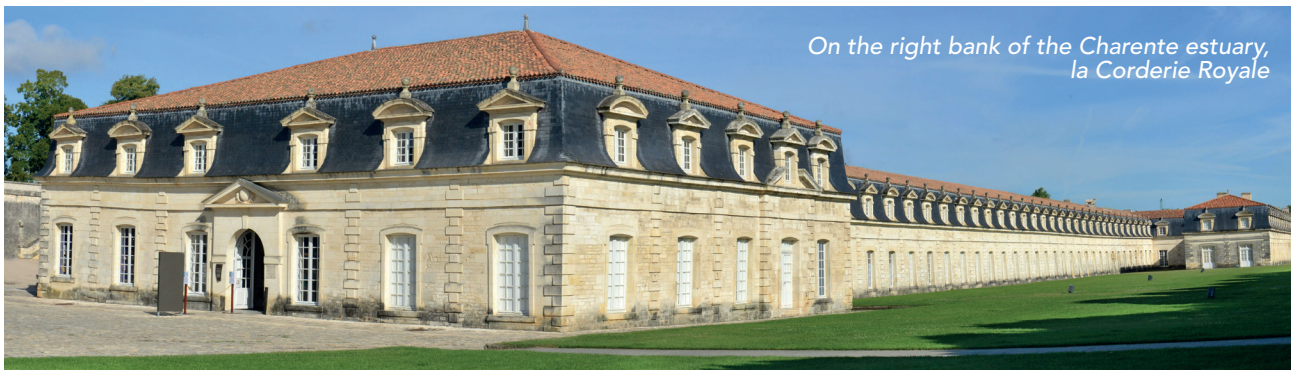
On the right bank of the Charente estuary, la Corderie Royale

Rochefort, a shipyard town became a town of Art and History