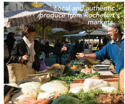
Local and authentic produce from Rochefort's markets