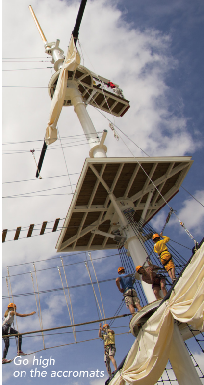
Go high on the accromats