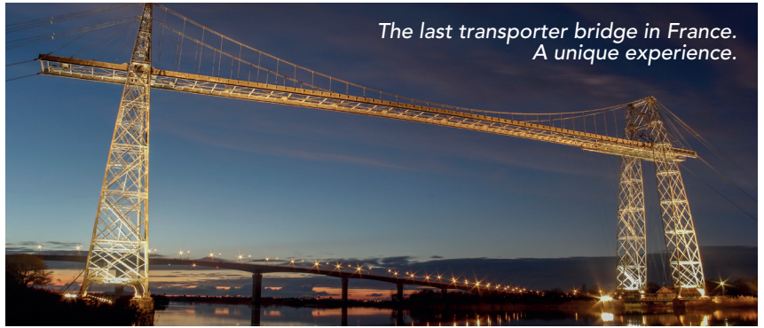
The last transporter bridge in France. A unique experience.