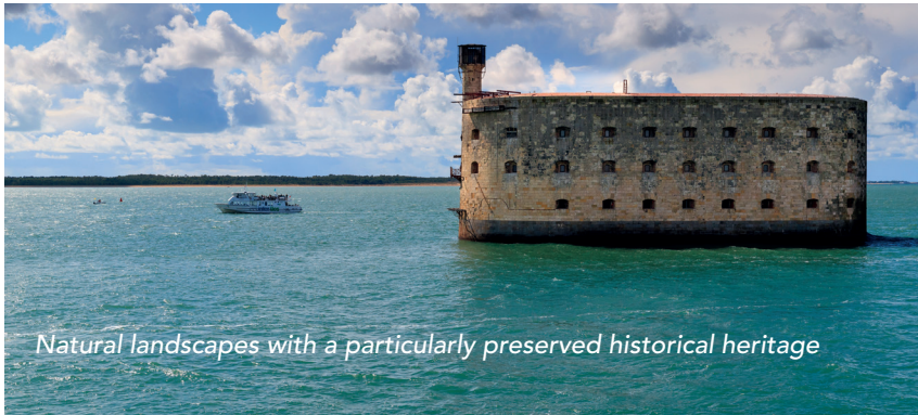
Natural landscapes with a particularly preserved historical heritage

Rochefort, a shipyard town became a town of Art and History