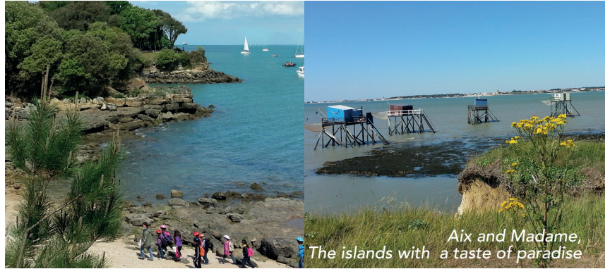
Aix and Madame, The islands with a taste of paradise

Rochefort Ocean, a territory between land and sea