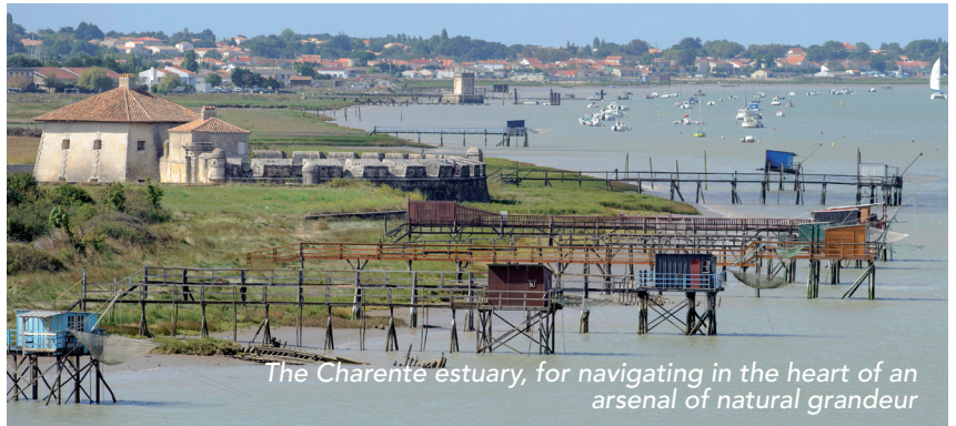
The Charente estuary, for navigating in the heart of an arsenal of natural grandeur