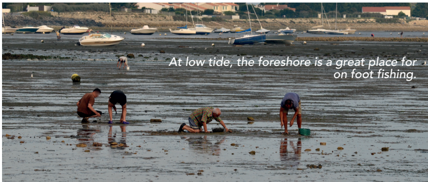
At low tide, the foreshore is a great place for on foot fishing.