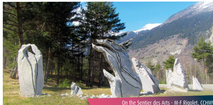
On the Sentier des Arts - M-F Rigolet, CCHMV

The idea of an imaginary safari inspires you to embark on your first forest ascent. It's not long before you're far from the road, going from encounter to encounter. All dressed in white, the statues that adorn your path seem to welcome you, one by one. Guided by the scent of spruce trees releasing their resin, head towards Avenières and its island of cool!