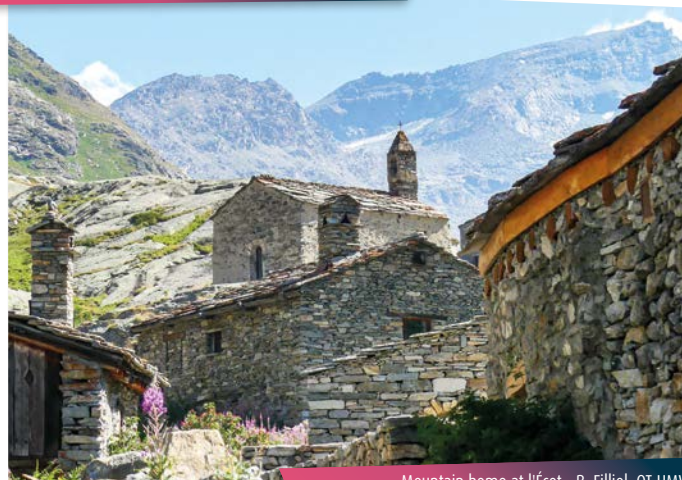
Mountain home at L'Écot

You'll get back to Bonneval with the feeling that today, you've been told a beautiful fairy tale.