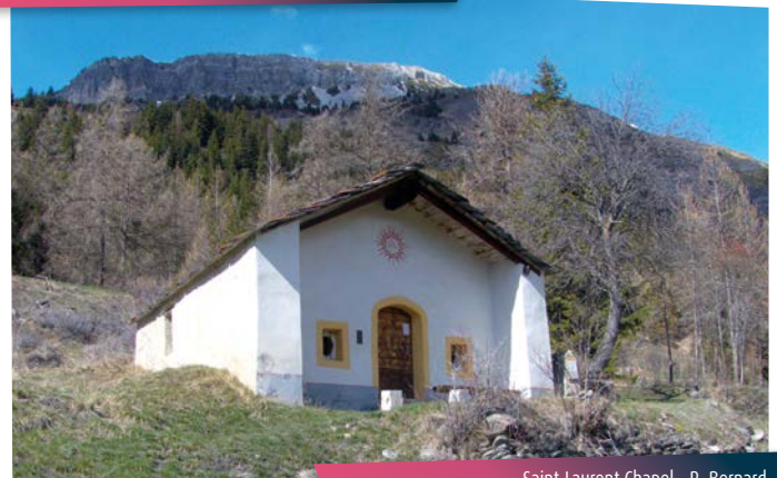
Saint-Laurent Chapel

Can you hear the Diet waterfall behind you?