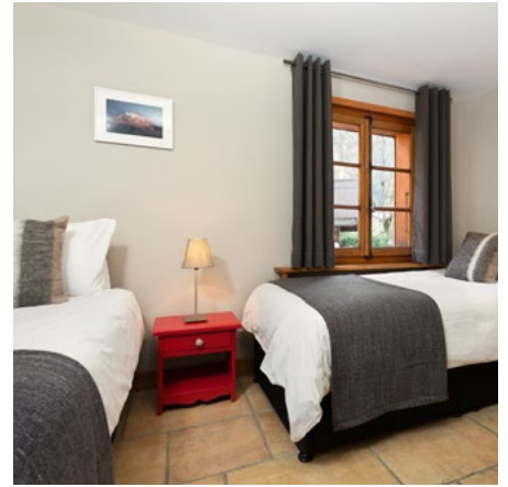
Twin ensuite bedroom