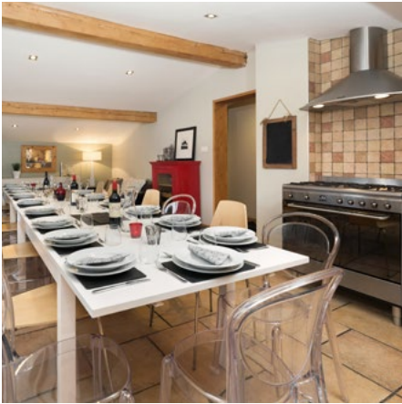
22 person dining area