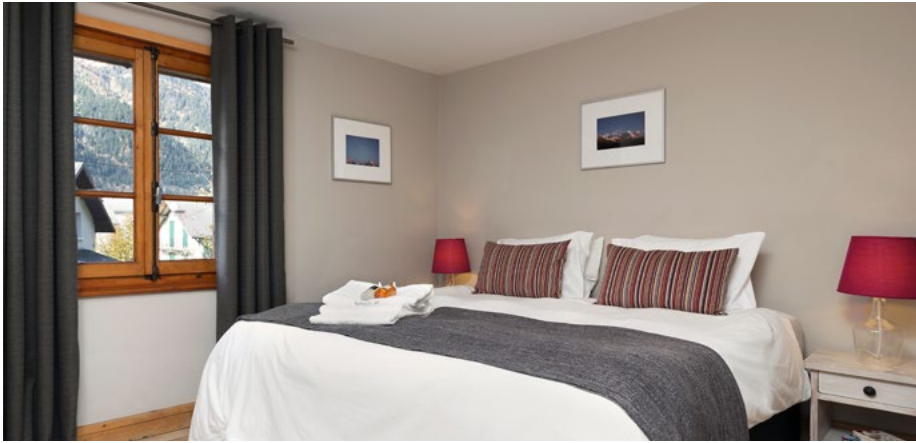
Quality bedding throughout