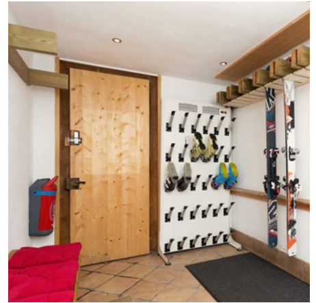
Heated ski room with boot dryer