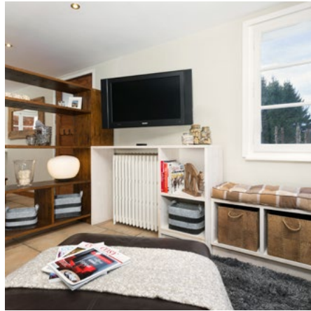
3 lounge dining areas with Apple TV entertainment