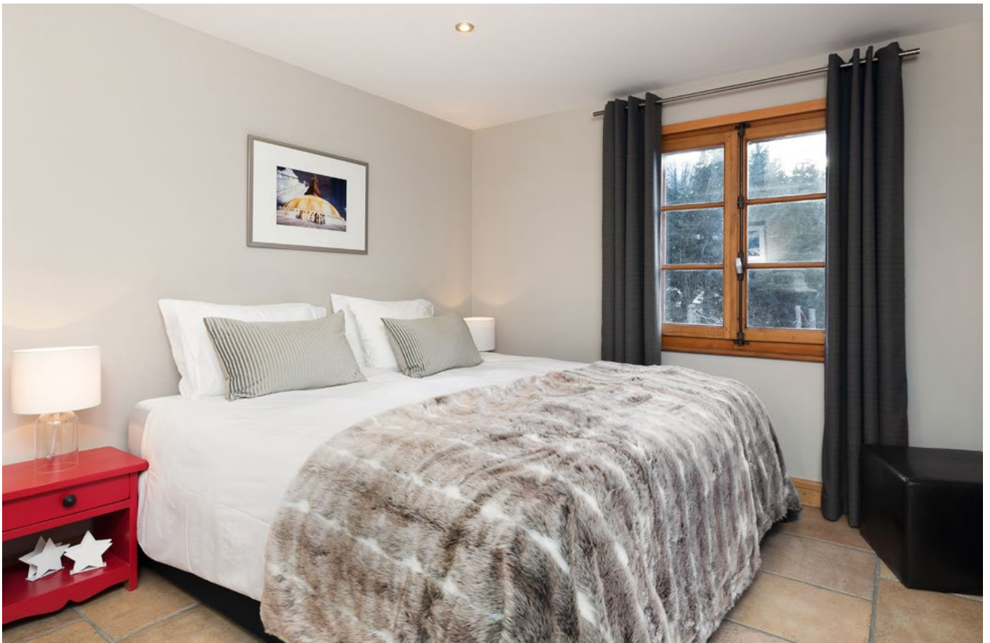
Flexible zip and link beds convert from superking to twin to suit family or business trips