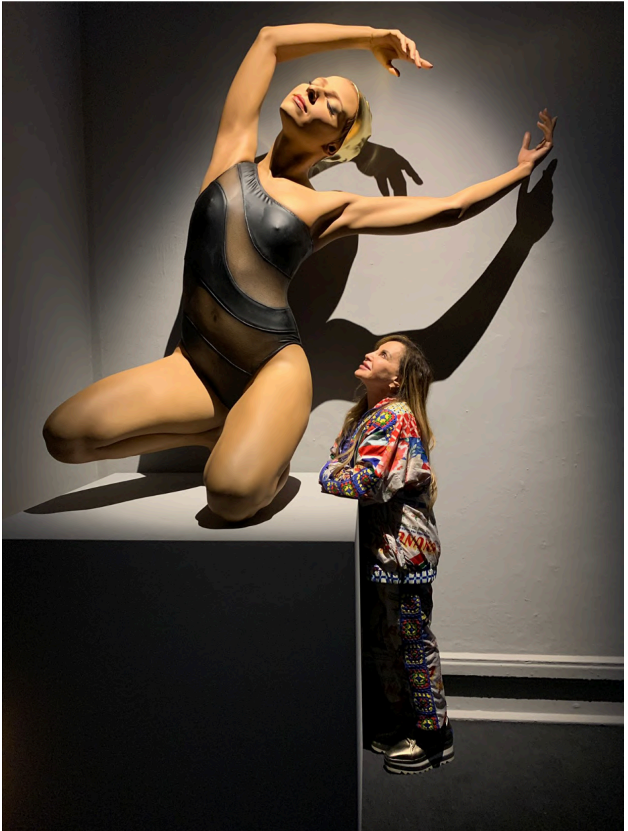
'Corpus Domini' , Exhibition at Palazzo Reale Piazza Duomo in Milan (October 2021)