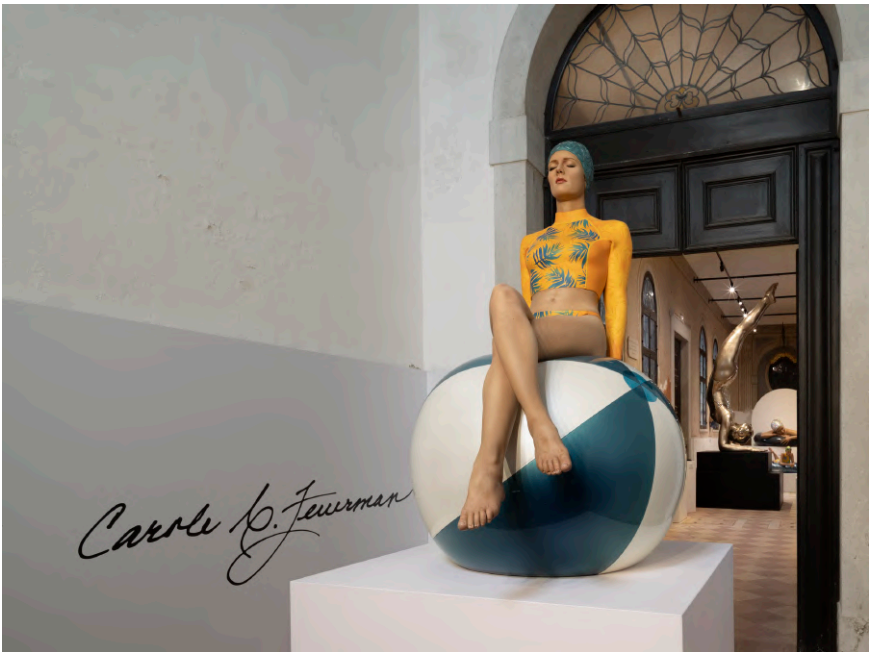
'My Stories' , Solo Exhibition in conjunction with the Venice Biennale 2022 at Santa Maria della Pietà Church (April - November 2022)