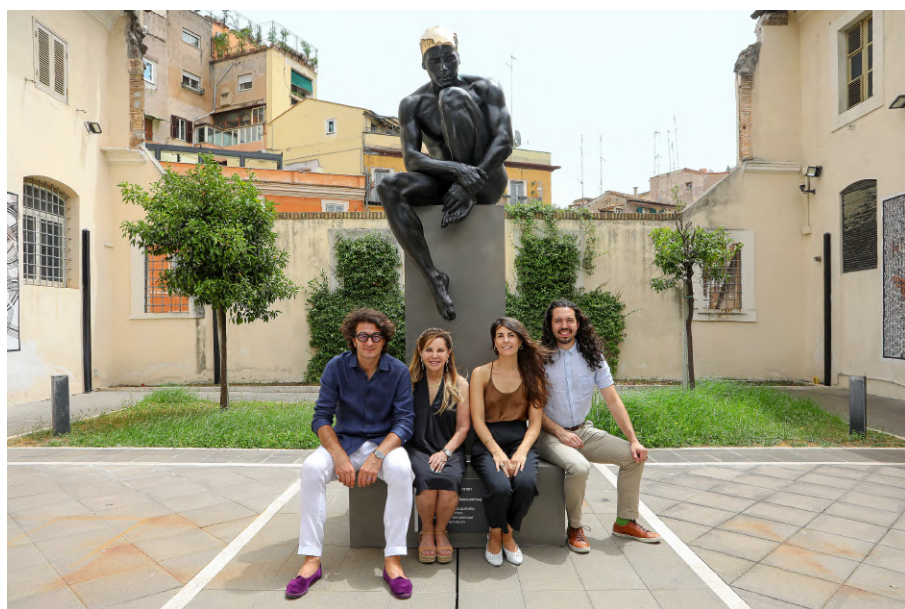
Exhibition at the GAM (Galleria Comunale d'Arte Moderna) in Rome (July - October 2021)