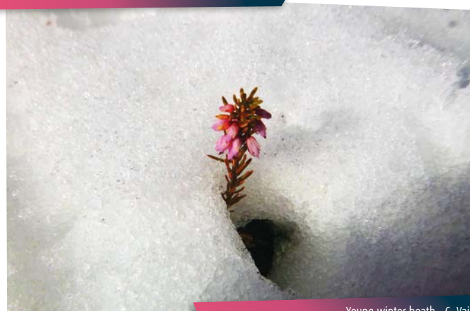
Young winter heath - C. Vair

As you approach the imposing limestone peak, your eyes are drawn to a peculiar little shrub. Meet Erica Carnea... Sounds like a movie star, doesn't it? But it's really a protected species in Vanoise National Park. Is this the plant they call winter heath? Bold and eager, it manages to grow even before winter comes to an end. With its colourful little bells, it braves the bad weather and can even break through the blanket of snow. What a find! But be careful not to trample this little gem, it's very rare in France!