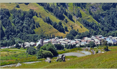
Micro-adventure July 26 to August 30, 2025

Departing from Alpe d'Huez, board a Defender towards the Praouat spine, a blade of schist with silver reflections.