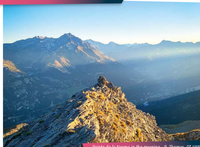
Pointe de la Norma in the morning

It's a good idea to leave early in the morning, in order to reach your destination before the sun is at the zenith. The descent will be more comfortable and you can happily take as many refreshing breaks as you need.