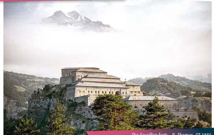
The Esseillon forts

Structured like a small village, Fort Victor-Emmanuel invites you to stroll through its labyrinthine alleys. You'll get a glimpse of what it was like to be a soldier in those days as you explore the various buildings that shaped their everyday life: chapel, hospital, gunpowder factory, and even... prison and cemetery! It can't have been fun all the time... But luckily, that's no longer the case, as there are now a wide range of activities on offer at this fortress, truly one of a kind in France.